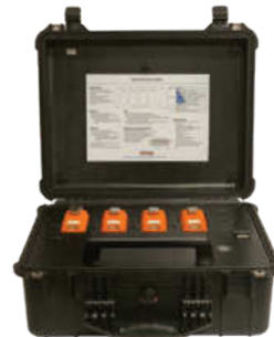
Bump/Cal Test Station (Compatible with CO, H 2 S & O 2 )