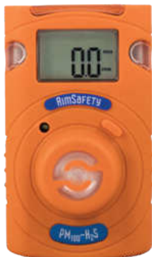
PM100-H 2 S